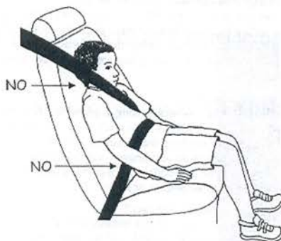
Figure 1: Small child using an adult seatbelt without a booster seat