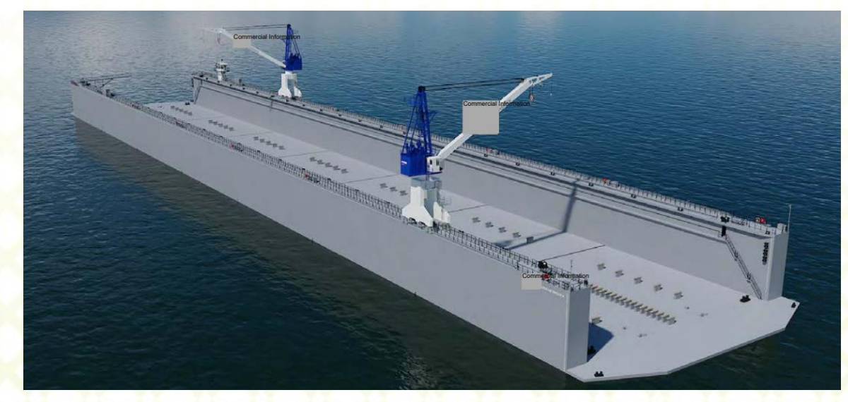
Floating dry dock graphic