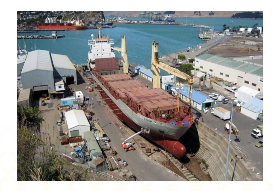
Lyttelton drydock above, Calliope Dock below (Devonport naval base)